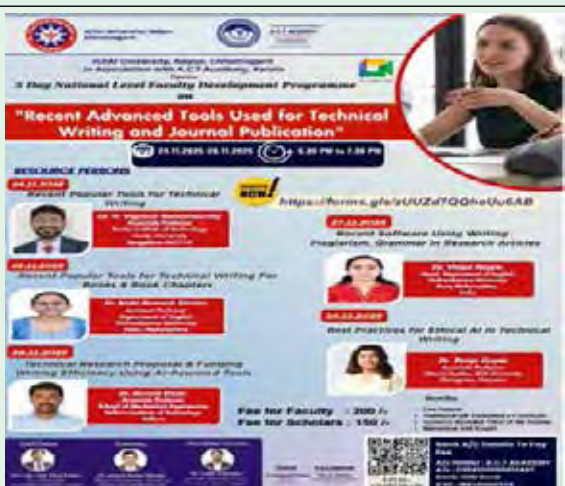
FDP (24-28Nov, 2025.) - 5 Days National Level Faculty Development Programme

“Recent Advanced Tools Used for Technical Writing and Journal Publication”