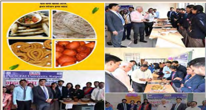
"गढ़ कलेवा"(08.11.2025) - गढ़ कलेवा चल संगी खाबो आज, हमर व्यंजन हमर स्वाद ICFAI University, Raipur

The activity proved highly meaningful, offering students constructive feedback, industry insights, and professional exposure, preparing them for real-world recruitment processes.