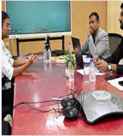
Mock Interview Session for Final-Year B.Tech & BCA Students (08.11.2025) - Mock Interview Session for Final-Year B.Tech & BCA Students ICFAI University, Raipur

To strengthen students' career readiness and bridge industry-academia expectations, M/s Sensible Computers and M/s Codelent Technologies, Bhilai, conducted a Mock Interview Session for final-year B.Tech and BCA students at the university campus.