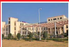
The ICFAI University, Jaipur