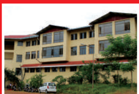
The ICFAI University, Meghalaya