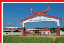
The ICFAI University, Nagaland