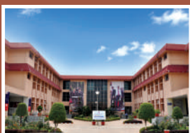
The ICFAI University, Dehradun