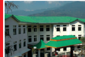
The ICFAI University, Sikkim