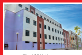
The ICFAI University, Himachal Pradesh (Baddi)