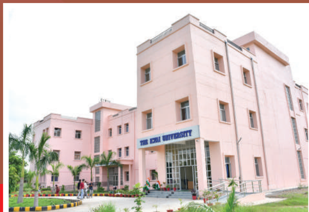
The ICFAI University, Raipur