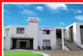
The ICFAI University, Jharkhand