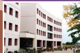
The ICFAI University, Tripura