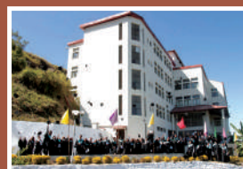
The ICFAI University, Mizoram